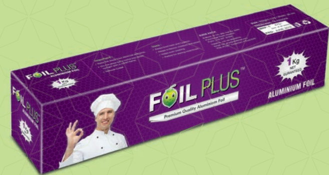
Foil Plus Aluminium Kitchen Foil 1 kg Net | 300 mm x 18mic