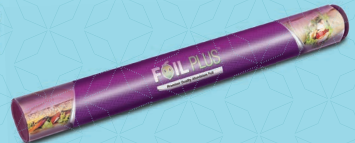
Foil Plus Aluminium Kitchen Foil 18 mtr | 300 mm x 11 mic