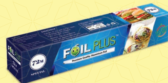
Foil Plus Aluminium Kitchen Foil 72 m special | 300 mm x 11mic