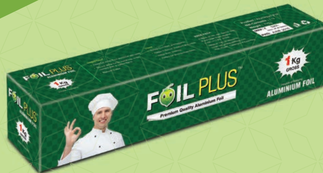
Foil Plus Aluminium Kitchen Foil 1kg Gross | 300 mm x 18 mic