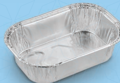
Foil Plus AFC 100 ml