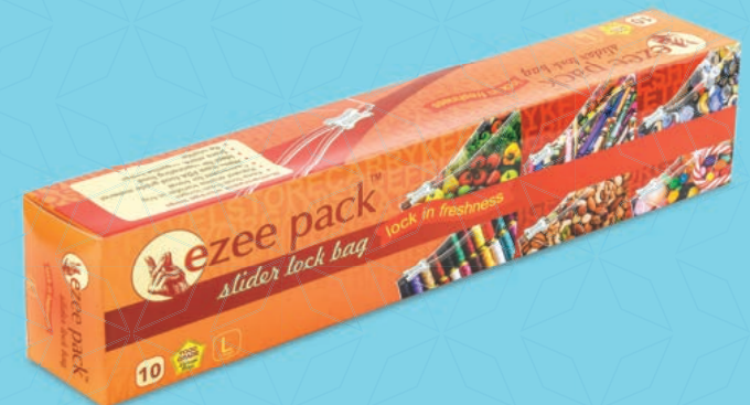
Ezeepack Slider Lock Bag