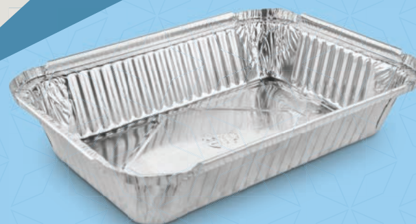
Foil Plus AFC 900 ml