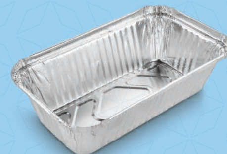
Foil Plus AFC 660 ml