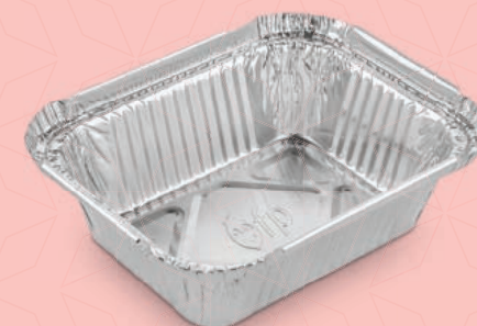
Foil Plus AFC 250 ml