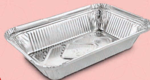
Foil Plus AFC 750 ml