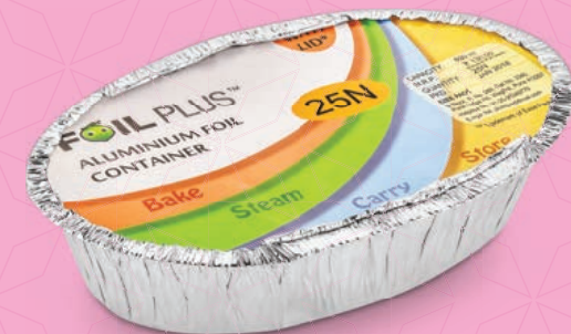
Foil Plus AFC 600 ml ( 25 pc Pack )