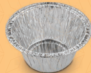
Foil Plus AFC Muffin Cup