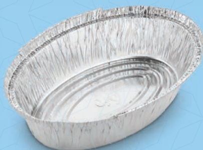
Foil Plus AFC 600 ml