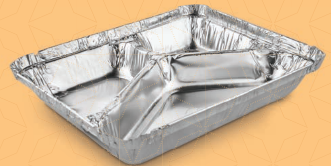
Foil Plus AFC 3 CP