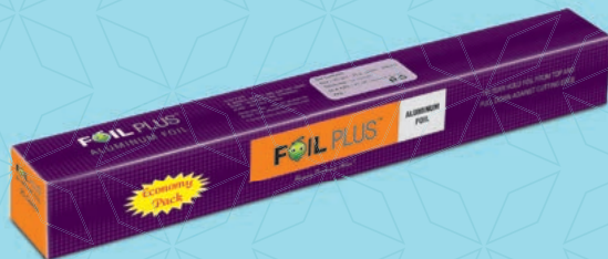
Foil Plus Aluminium Kitchen Foil 25gm | 300 mm x 11 mic Economy Pack