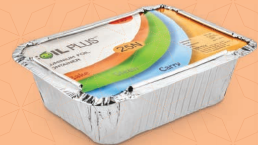
Foil Plus AFC 450 ml ( 25 pc Pack )