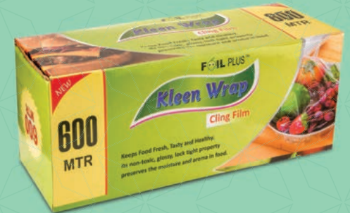
Foil Plus Kleen Wrap Cling Flim | 600 mtr