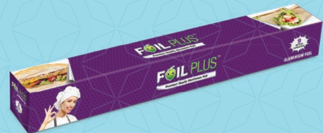
Foil Plus Aluminium Kitchen Foil 9 mtr | 300 mm x 11 mic