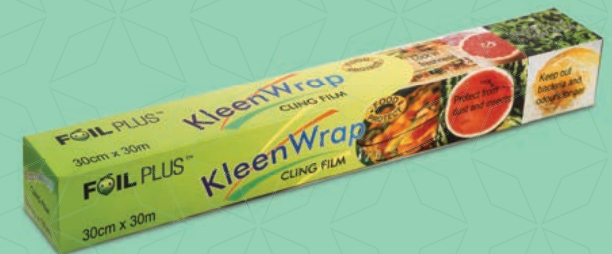
Foil Plus Kleen Wrap Cling Flim | 30 mtr