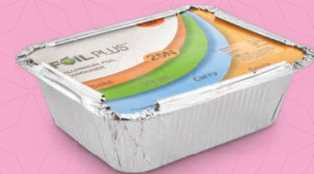
Foil Plus AFC 250 ml ( 25 pc Pack )