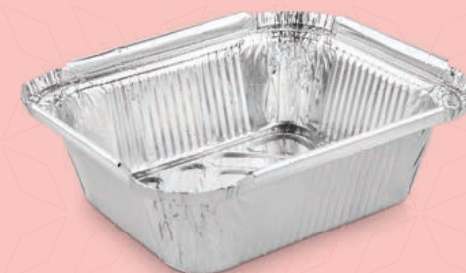
Foil Plus AFC 450 ml