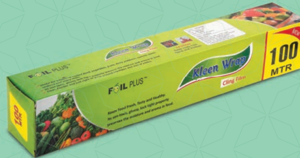
Foil Plus Kleen Wrap Cling Flim | 100 mtr