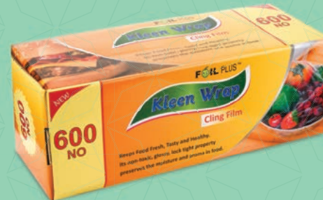
Foil Plus Kleen Wrap Cling Flim | 600 No