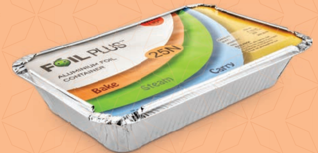
Foil Plus AFC 750 ml ( 25 pc Pack )