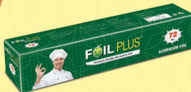
Foil Plus Aluminium Kitchen Foil 72 No | 300 mm x 11mic