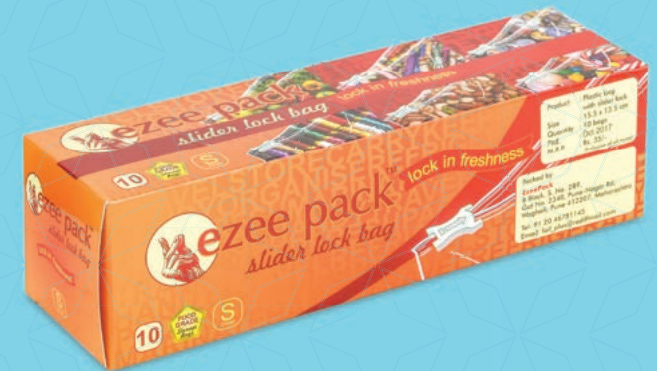
Ezeepack Slider Lock Bag