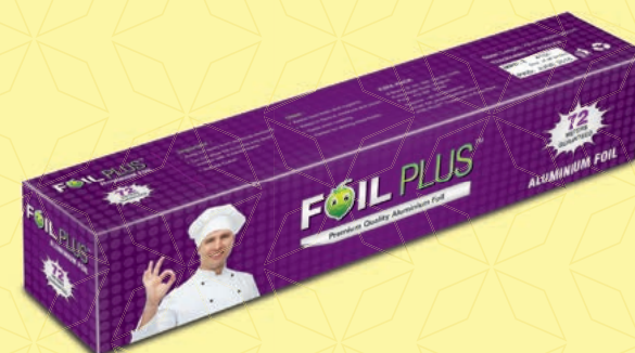
Foil Plus Aluminium Kitchen Foil 72 mtr | 300 mm x 11mic