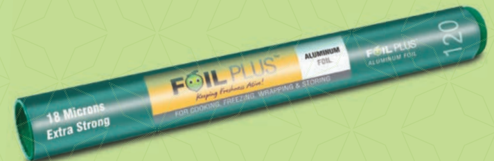
Foil Plus Aluminium Kitchen Foil 120 gm | 300 mm x 18 mic