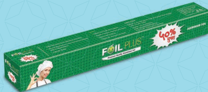
Foil Plus Aluminium Kitchen Foil 50 gm | 300 mm x 11 mic